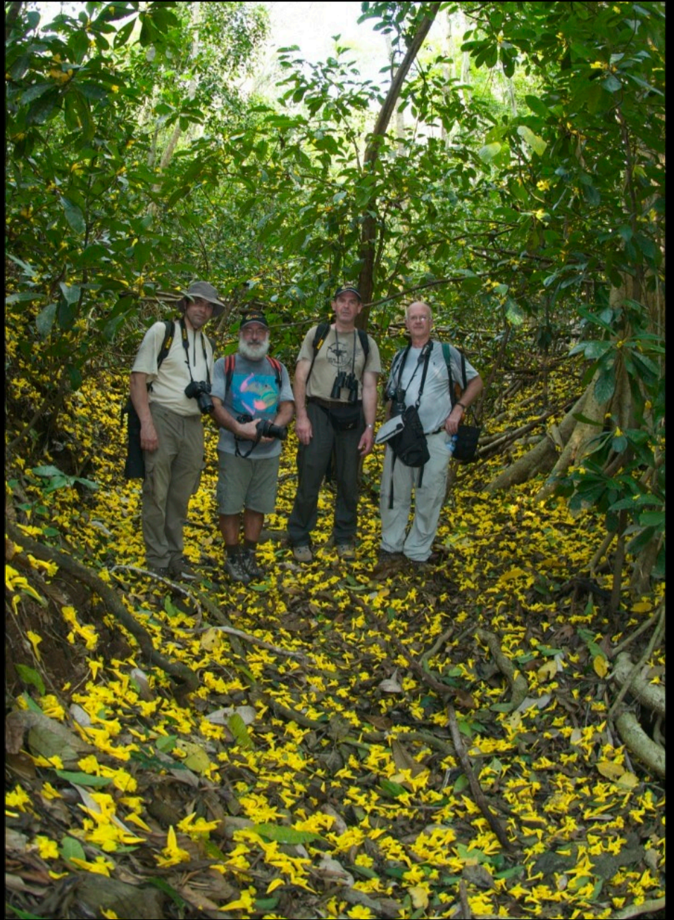
French Group in action at Carara National Park.