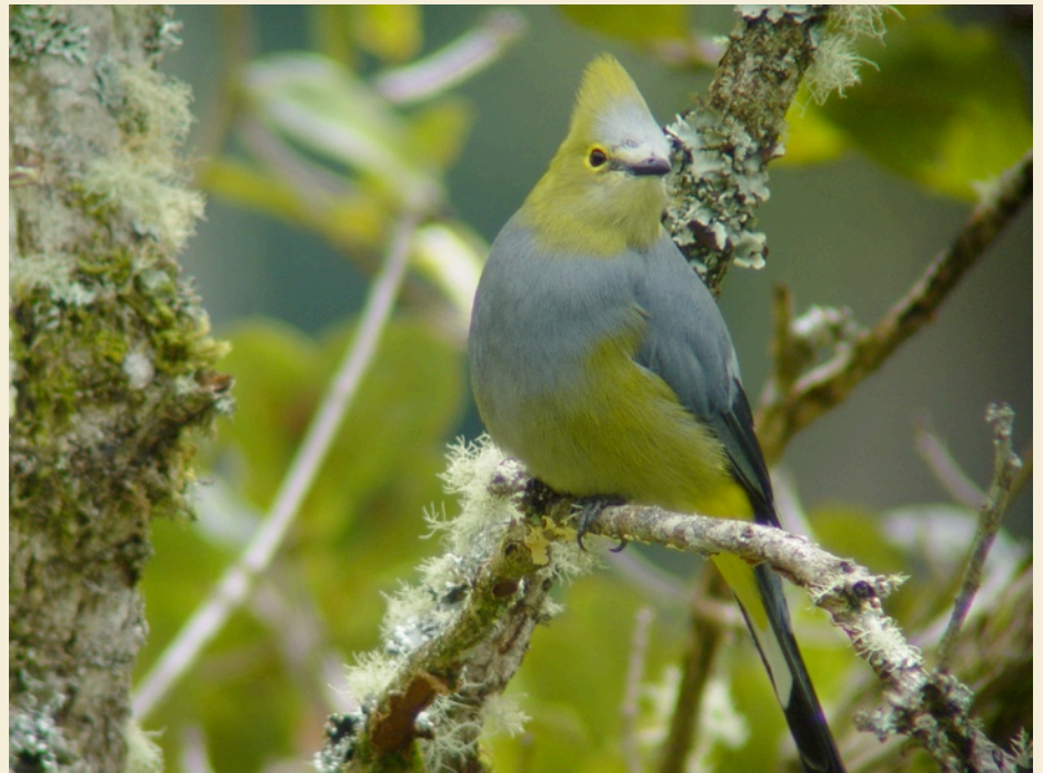
This trip is design to cover Caribbean Lowland Forest, Caribbean Rainforests, Caribbean Cloud Forest, and Pacific Highland Forests.